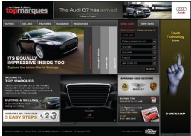
01 Top Marques website www.topmarques.co.uk